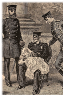
Found in the back of my baby picture frame! Quite telling!!

Welcome to my memoir's Newsletter. Keeping you up to date on the latest developments and events, such as book signings, talks at book clubs, writer's groups, podcasts and anywhere I'm invited to speak about this incredible story!