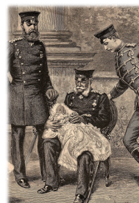
Found in the back of my baby picture frame! Quite telling!!

Welcome to my memoir's April Newsletter. Keeping you up to date on the latest developments and events, such as book signings, talks at book clubs, writer's groups, and anywhere else I'm invited to speak about this incredible story!